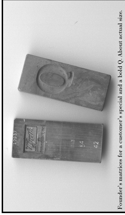
Founder's matrices for a customer's special and a bold Q. About actual size.

Many famous names in type design were type-founders: in Europe, Bodoni, and Fournier, in England Caslon and Baskerville, are the best-known. Many others were employed by foundries, before the rise of Monotype (and later processes). Even today, a very few amateur enthusiasts still continue the tradition, designing & cutting their own punches.