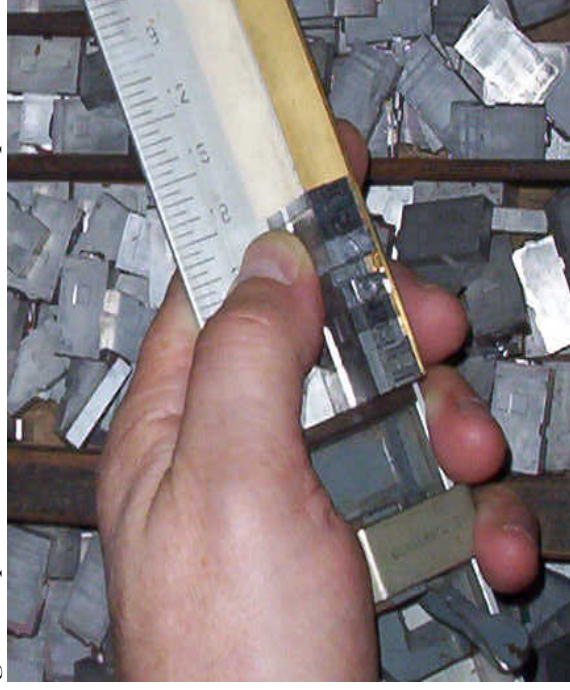
Assembling the type: the thumb holds the type in place & feels the nicks forming a groove.